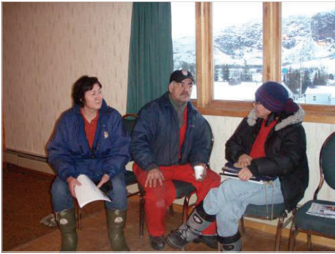
Above: Residents of Nain attending the Open House