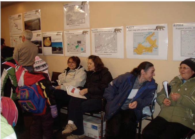
Above: Residents of Hopedale at November 20, 2007 Open House

While the topics of discussion varied, the people in attendance were very engaged and eager to hear more about the Michelin Project and to share their own perspectives. We learned a great deal from the communities on a variety of topics.