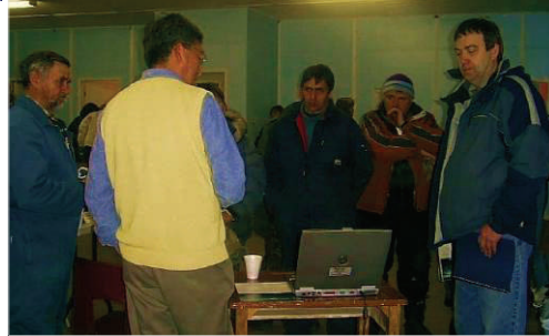
Right: Makkovik residents listening to info provided by Golder Associates