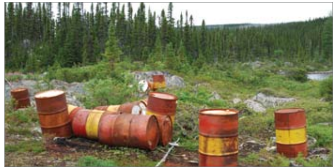
Old 45-gallon oil drums left near the Michelin Project area by previous operators.