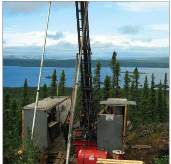
Drilling at the Jacques Lake site, July 2007