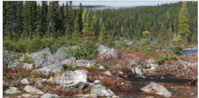
Same site, after Aurora's clean-up team completed waste removal, October 2007.