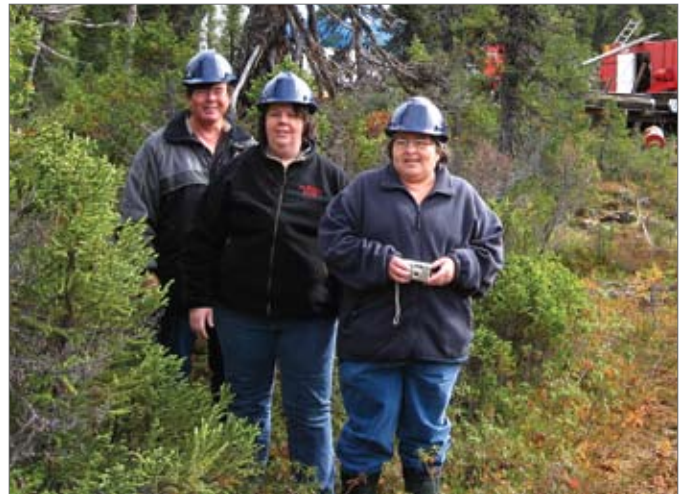
Visitors from Postville tour one of Aurora's drilling sites, Summer 2007.

to speak about the experience of living next to a uranium mining operation, as well as some of the benefits associated with it.