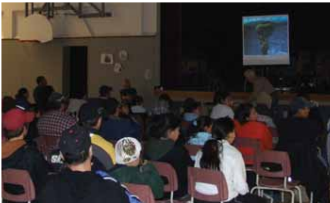
Residents of Hopedale view animation of the open pit mining process at Aurora's information session on October 23, 2008.

In 2009, Aurora plans to return to coastal Labrador for further discussions with community members on tailings management and employment and training, topics that residents and local governments have identified as important parts of the proposed Michelin Project.