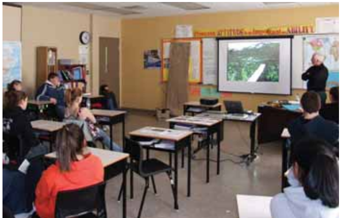
Aurora presented to junior and senior high school students throughout the North Coast, including Postville.

Aurora's community outreach team members joined with some of our senior management to give presentations to residents of Rigolet, Makkovik, Postville, Hopedale, Happy Valley-Goose Bay and North West River (the information session scheduled for Nain had to be cancelled due to weather. Aurora is rescheduling this session and will advertise the new date in Nain once it has been set).