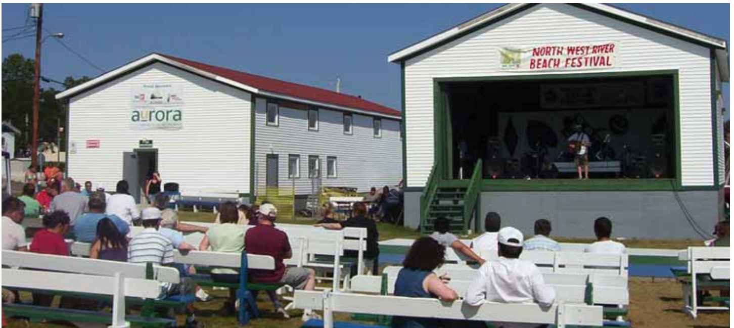
Local festivals, such as this one in North West River, are excellent opportunities for Aurora to make meaningful community contributions.

For more information on our community contributions, please visit Aurora's website: www.aurora-energy.ca